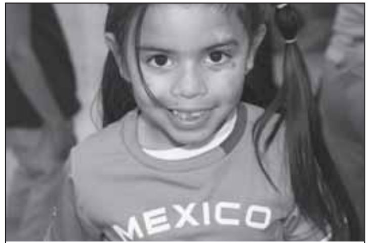
Student from Amelia Earhart Elementary-Middle School